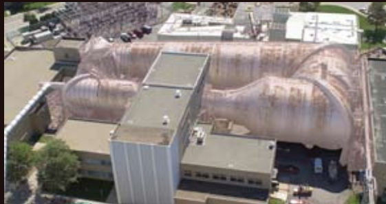
Altitude Wind Tunnel/Space Power Chamber