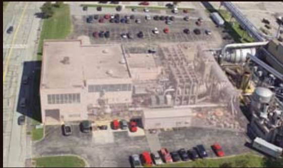
Propulsion Systems Laboratory 1 and 2

NASA Glenn Research Center is planning to demolish its Altitude Wind Tunnel, including the Space Power Chamber, and Propulsion Systems Laboratory 1 and 2 due to safety and environmental concerns. These facilities have been idle for over 25 years and are in poor condition. Both facilities have made significant contributions to aerospace history, and NASA desires to document and share their exciting story. NASA Glenn is currently undertaking a significant effort to capture the history of these facilities. Although these historic facilities will be removed, their story will endure.